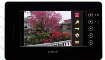
915M7b - black