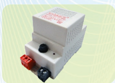
915P power supply