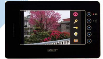
915M7b - black