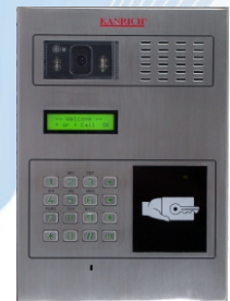
915C8/C8M stainless steel camera /stainless steel camera with mifare card reader