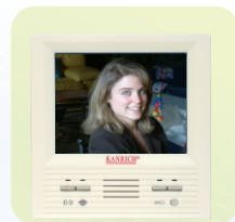
915Mh 4" color LCD Monitor