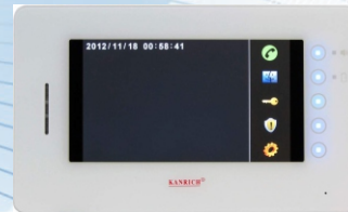
915M7b - white