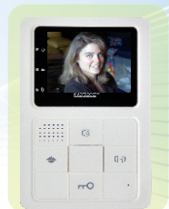
915M35 3.5" color LCD Monitor