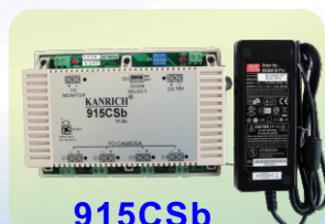
915CSb Camera Selector