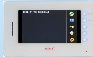
915M7b - white