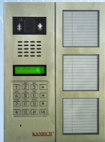
915C7 PH-NP stainless steel camera name plate