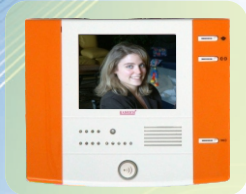
915Mi 4" color LCD Monitor