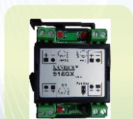
915SX switching box for door bell