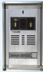
915C3AL aluminum door bell with CCD