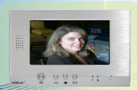
915M7 7" color LCD Monitor